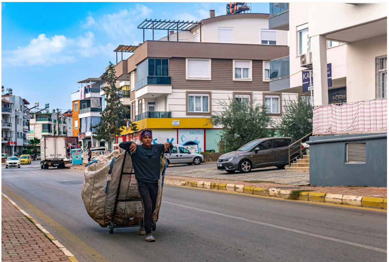
Informal collector of plastic waste and recyclables in a residential area in Antalya, Turkey, 2022.

Refugees and migrants often take on jobs in the informal waste management sector. A study of 1,500 waste pickers and scrap dealers in Abuja, Nigeria found that approximately 56 per cent of them were migrants, and another 24 per cent were refugees from neighbouring countries, such as Chad and Niger (Ogwueleka and Naveen 2021). Another example is Nepal's Kathmandu valley, where waste collectors working with bicycles are exclusively