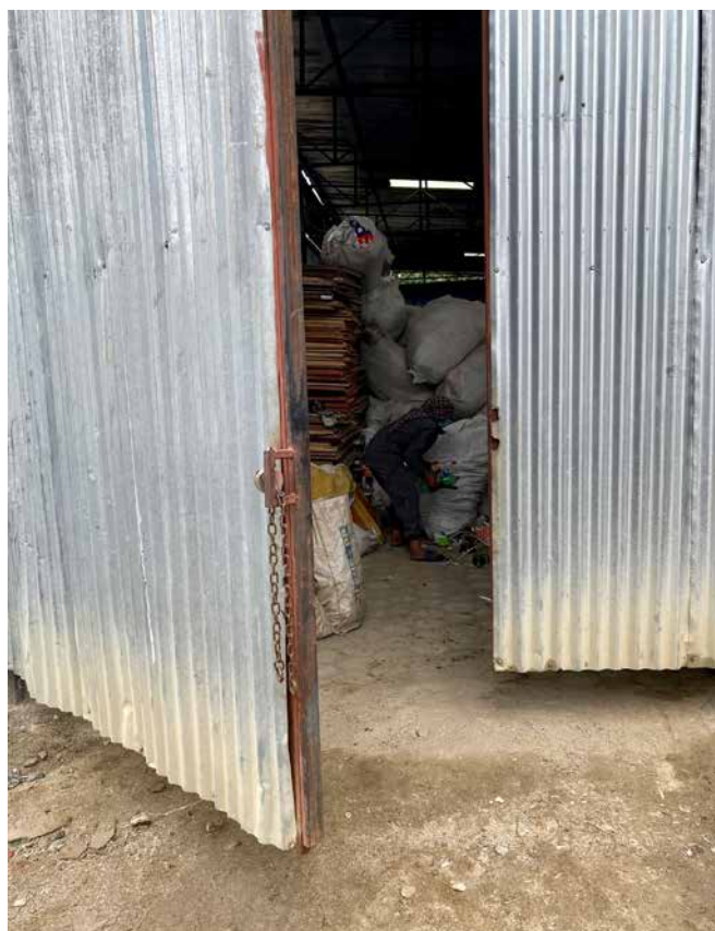
Woman sorting plastics at Doko Recyclers' segregation facility, Kathmandu, Nepal, 2022.

This policy paper provides a summary of our current understanding of the informal recycling sector; its social, economic, and environmental characteristics in national and international contexts; and the challenges the sector faces. It examines international and national efforts to recognise informal workers and involve them in formal frameworks and agreements that could be an inspiration for the upcoming international legally binding instrument on plastic pollution. It also provides a set of high-level policy recommendations inclusive of the informal recycling sector, enabling a just transition and the protection of the informal recycling workers' livelihoods. The proposed recommendations focus on enhancing the role of the informal recycling sector in a circular economy as indispensable partners in the fight against plastic pollution and achieving a healthy environment for all.