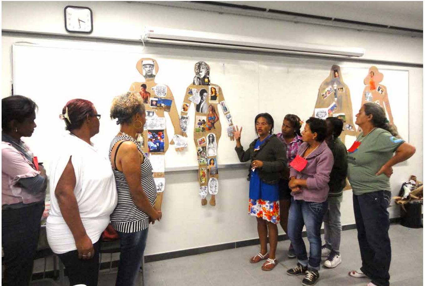
WIEGO's Action Gender & Waste Research workshop: women waste pickers discuss gender differences. Belo Horizonte, Brazil, 2012.

The IRS has demonstrated a high level of resilience. However, building capacities of key IRS actors on governance, protection measures and technical issues is required. The informal recycling workers and those who represent them should understand their roles and responsibilities in the global and national governance landscape, and should be informed about their right to protection.