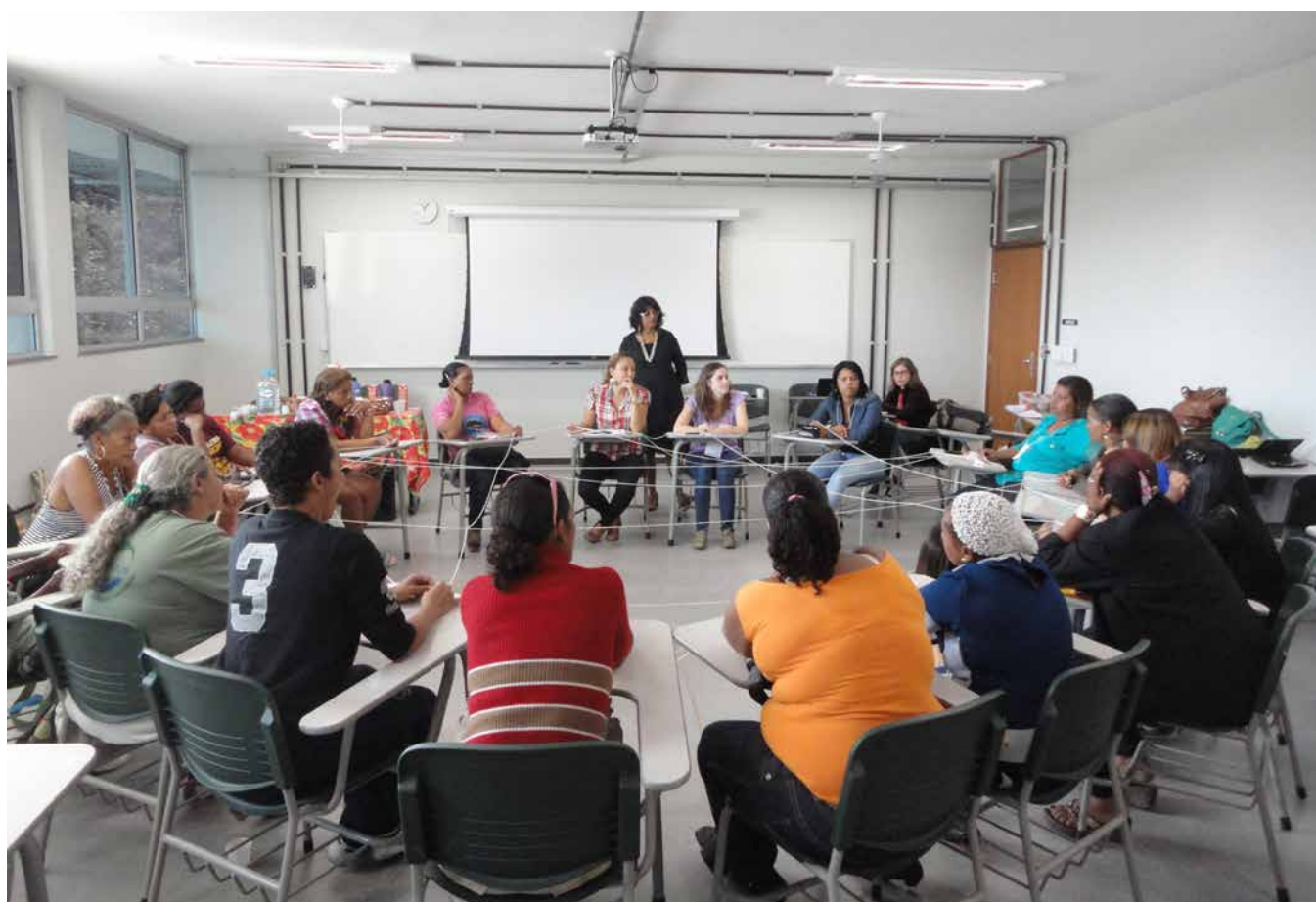
WIEGO's Action Gender & Waste research workshop: creating space for affection and webs of knowledge through participatory tools. Belo Horizonte, Brazil, 2012.

In addition, gender-sensitive communication strategies should be applied to de-stigmatise workers and raise awareness on the role and contribution of equal participation in the valorisation of plastics. This should