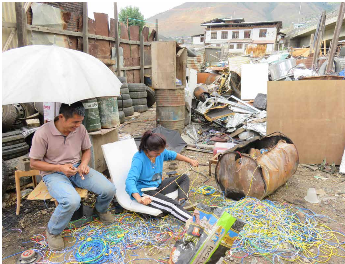
Informal trade workers at a scrap yard in Thimphu, Bhutan, 2018. Scrap is collected and exported to India.

Informal recycling workers need fair and reliable payment to ensure that their services are sustainable in the long term. Since they provide services both in the service chain (to cities) and in the value chain (to industry), setting out contracts that contain clear rules on how to calculate the value of their work in both these areas is key for a just transition addressed by the international legally binding instrument on plastic pollution.