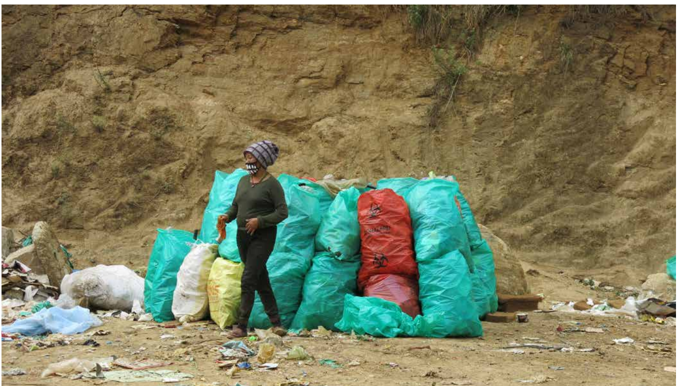
Female waste picker at Memelakha landfill in Thimphu, Bhutan, 2018.

Finally, it should be noted that integration of the IRS should take into account women's disproportionate burden of taking care their children, older and disabled family members and housework in order to provide flexibility to juggle multiple roles. Any efforts toward formalisation of the IRS must carefully consider women's rights and working conditions vis-à-vis men, and give a voice to women in related decision-making processes. Moreover, when waste-picking activity is formalised, women often do not enjoy the same opportunities as men for fair earnings. The case of Brazil's solid waste management serves as an example. A gender analysis of an official database called the Social Assessment Information System (RAIS in Portuguese), which records information of employees of commercial establishments, concluded that among waste pickers, men earn much more than women in all age groups, and no women are found in the highest income groups (those that earn more than 10 times the minimum wage). These discrepancies may be why women are drawn to the cooperative model to find more favourable working conditions (Dias and Fernandez 2013).