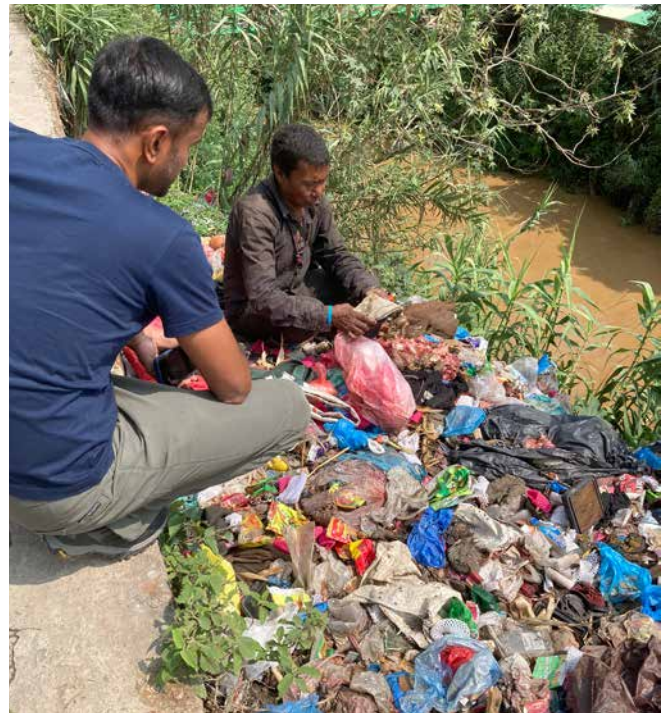
A waste picker sorting plastics from waste that has been dumped on the side of Bagmati River, Kathmandu, Nepal, 2022.

While leading organisations advocate for the closure of dumpsites and landfills, ostensibly for reasons of cost savings and environmental benefits (Agamanthu and Law 2020), such measures come at great cost to informal recycling workers, cutting them off from their main source of livelihood. One such case is the closure of the notorious Akouédo dump in Abidjan, Côte d'Ivoire, in 2019, because of the illegal dumping of toxic waste that harmed the environment and human health (EJAtlas 2020a). In Delhi, India, where the door-to-door collection of waste has