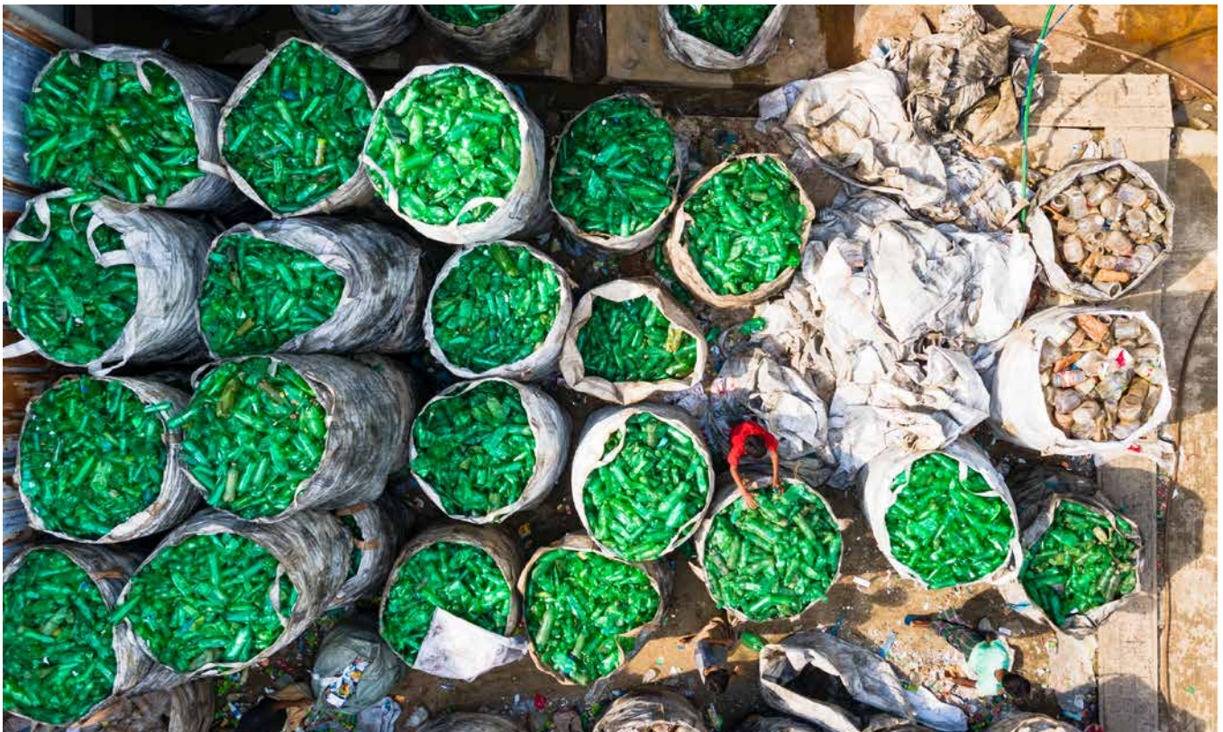
Bags of recyclables on a dumpsite near Dhaka, Bangladesh.

India, Indonesia, the Philippines and Viet Nam, among the top contributors to plastic pollution, share many similarities regarding the state of their waste management