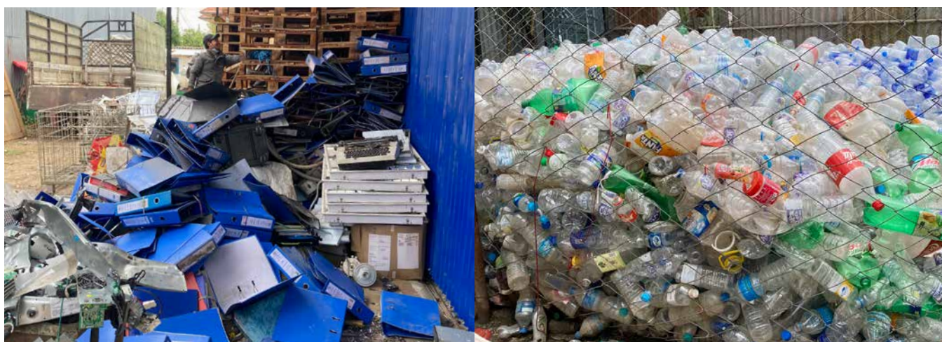
Piles of different types of plastics sorted at Doko Recyclers' segregation facility, Kathmandu, Nepal, 2022.

In 2019, the Basel Convention expert working group "on environmentally sound management (ESM)" decided to include in its work programme provisions for the collection of initiatives to promote environmentally sound management in the IRS. 5 More specifically, under the ESM tool the group developed "Guidance on how to address the environmentally sound management of wastes in the informal sector" 6 , which at the time of writing was still in the drafting phase. The objective of this document is "to provide guidance on how to address and improve environmentally sound management of waste in the informal sector and describe ways to mitigate the potential for adverse environmental impacts (e.g., open burning, indiscriminate dumping of residual wastes, etc.) and to provide considerations for how to integrate the informal sector". However, this guidance does not look into aspects of labour, social framework, security, or any other non-ESM related issues. In addition, the expert working group has collected several case studies to provide practical examples of measures used to further environmentally sound management in the IRS. These examples have been uploaded onto the Basel Convention website. 7