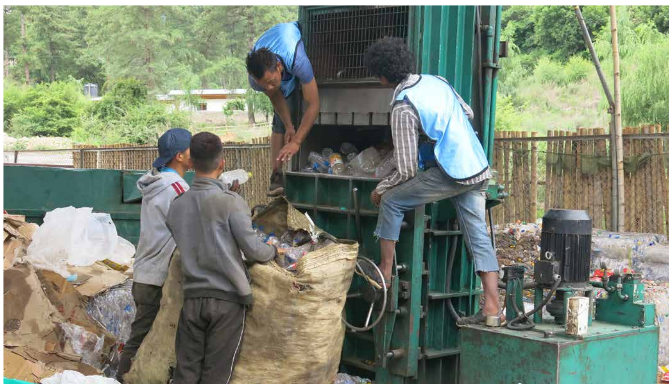
A group of men compressing PET-bottles at the "Greener Way" transfer station in Thimphu, Bhutan, 2018.

In India, a higher portion of women work as street sweepers and landfill waste pickers, tasks that require higher levels of concentration and are more informal in nature compared to other tasks within the waste management sector (UNDP 2021). In some Vietnamese cities, women make up 65 per cent of all waste collectors and over 70 per cent of junk shop owners (USAID CCBO 2021a). However, research from other countries found that, compared with men, women generally have less access to equipment, vehicles and the finances to purchase them; as a result, they are less able to access, collect and transport larger volumes of waste, which in turn exacerbates income disparities and diminishes women's upward mobility (Aidis and Khaled 2019). The association, Women in Informal Employment: Globalizing and Organizing (WIEGO), concludes that women working in the IRS are concentrated at the bottom of the economic pyramid (WIEGO 2020).