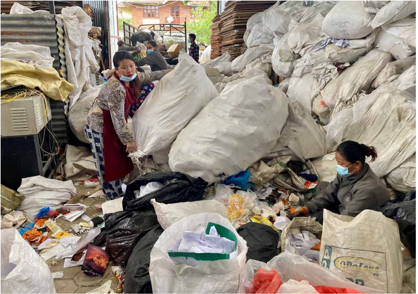
Women working at Doko Recyclers' segregation facility receiving new loads of recyclables to separate into different categories. Kathmandu, Nepal, 2022.