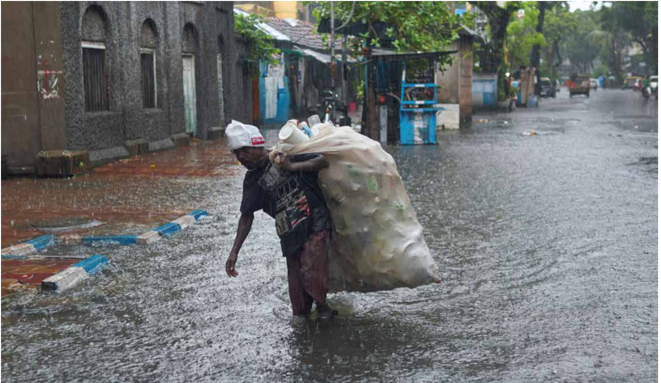
An informal recycling worker carrying a large polythene bag filled with empty disposable plastic bottles and other thrown away items is walking in rain, the street is flooded with rain water. Deshapriya Park, Kolkata, 2021.

dumpsite in Maputo, Mozambique that is surrounded by houses, landslides occurred frequently, accounting for over 150 deaths of which many were informal recycling workers (Kaza and Yao, 2018).