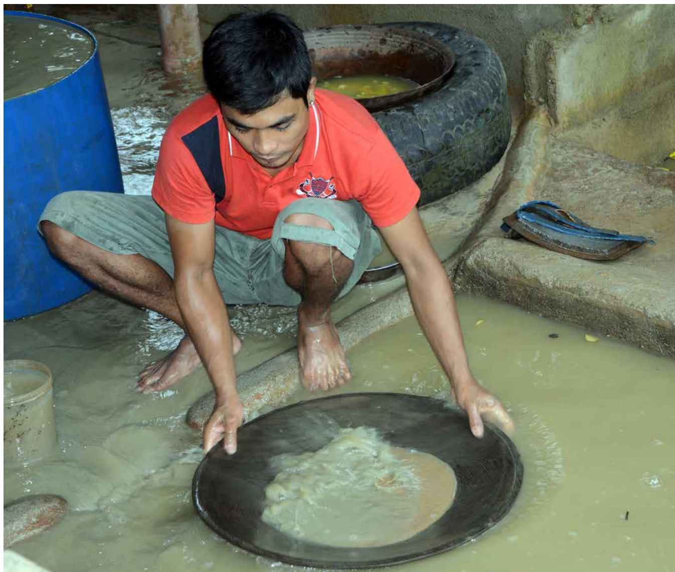
A worker handles mercury with bare hands in a small-scale gold mine in Camarines Norte, Bicol Region, Philippines, 2016.

Since there is no other global policy addressing the inclusion of the IRS in waste collection and recycling, it is crucial that negotiators of the international legally binding instrument on plastic pollution take advantage of the experience gained during the development and implementation of the Minamata Convention on Mercury in such a way that the treaty will be inclusive of the IRS.