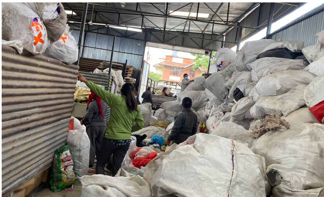
A truck arriving with more recyclable waste to sort, at Doko Recyclers' recycling segregation facility, Kathmandu, Nepal, 2022. Mainly women work with the segregation in this facility.

Informal recycling operations, however, are often marked by an unhygienic environment and poor practices, such as disposing unfavourable waste outside of legal places, which can contaminate soil and aquifers and result in other environmental problems (Sembiring and Nitivattananon