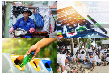
SOLID WASTE CAPACITY INDEX FOR LOCAL GOVERNMENTS (SCIL)

USAID Develops New Self-Assessment Tool to Strengthen Local Government Capacity for Sustainable Waste Management Systems - The Solid Waste Capacity Index for Local Governments (SCIL) enables local governments to self-assess their current SWM capabilities and pinpoint where capacity building is necessary to create and sustain more economically and environmentally sound waste management systems.