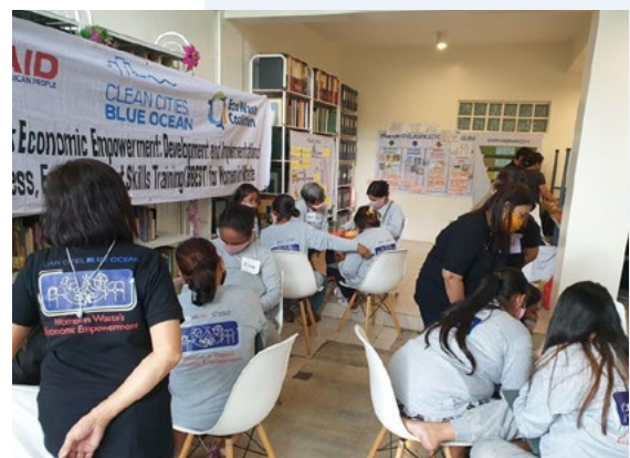
Mentors assisting trainees at the first Basic Business and Empowerment Skills Training in the Philippines.

WWEE promotes public-private partnerships that can formalize WWEE businesses through municipal contracts, raise the professional profile of solid waste and recycling providers, and eliminate legal barriers that hamper the development and success of women in the sector