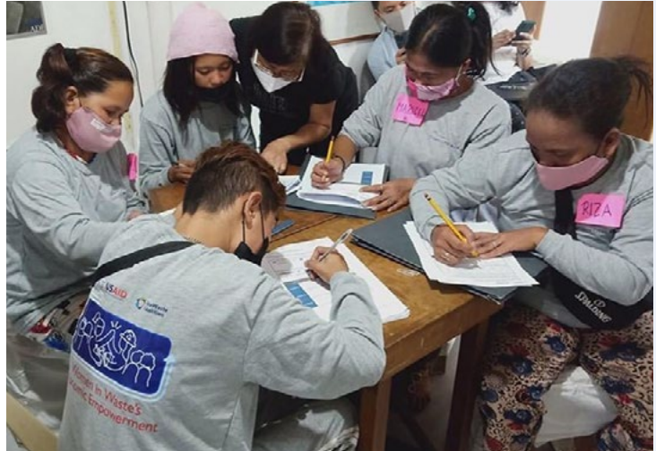
The first Basic Business and Empowerment Skills Training cohort in the Philippines under the WWEE activity.

Clean Cities, Blue Ocean's WWEE activity aligns with USAID's Gender Equality and Women's Empowerment Policy in its approach to advancing gender equality and economic security through the creation of green jobs in the waste sector. The activity is piloting a model that empowers women through tailored leadership, gender equality, solid waste management, health and safety, and business skills training so that they can develop the confidence and skills to develop formal relationships with local governments, and establish or expand their waste-related businesses.